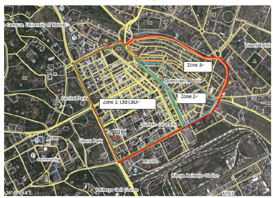
Figure-1: The data collection zones in Nairobi CBD

missing and therefore field data collection in the CBD was done to fill in the remaining names. During the field work, the CBD was divided into three zones as shown in figure 1. The researchers worked in pairs, taking the spatial location of the missing street names and recording them on a base map. In total 73 street names were recorded.