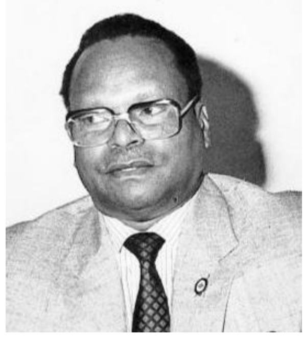
Figure-3: First Mayor of Nairobi, Charles Rubia.

The number of named streets has increased since the colonial period and according to the field study conducted the street names as at 1960 were 41 and as at 2013, have increased to 73 inclusive of