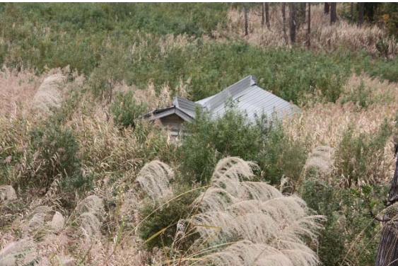
Fig 1. The image of the Kogomo Earthquake Memorial Park